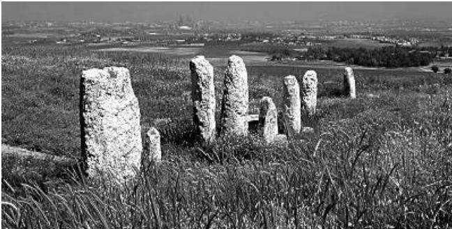
Stone pillars at Gezer

Other people see Christmas traditions as pagan practices. Early Christians began celebrating Christmas on December 25 th when the pagan sun god was worshipped. During that pagan festival, people decked the halls with holly and evergreen wreaths, exchanged gifts, and had lavish feasts. Some early Americans were disturbed by these pagan traditions. “To the New England Puritans, Christmas was sacred. The pilgrims’ second governor, William Bradford, wrote that he tried hard to stamp out ‘pagan mockery’ of the observance, penalizing any frivolity. The influential Oliver Cromwell preached against ‘the heathen traditions’ of Christmas carols, decorated trees, and any joyful expression that desecrated ‘that sacred event’ ” ( http://www.history.com ; search for Cromwell Christmas tree ).